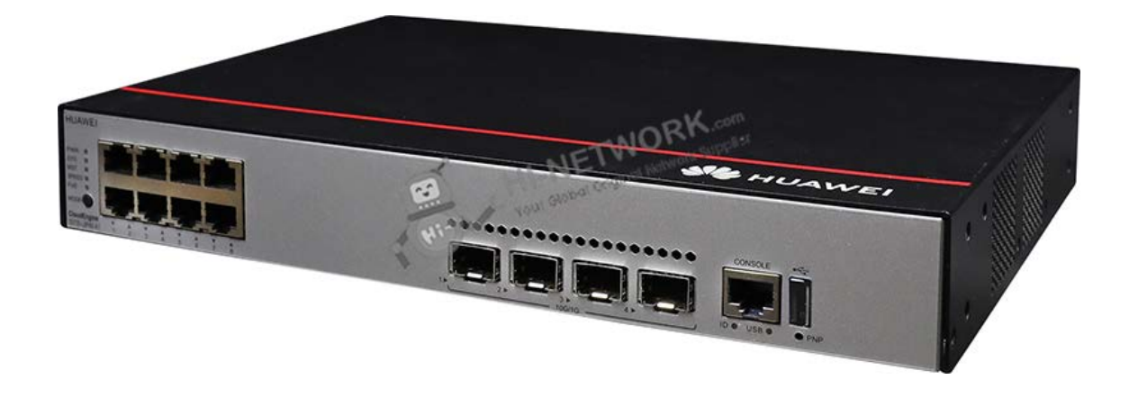
Figure 1 shows the appearance of S5735-L8P4X-A1.