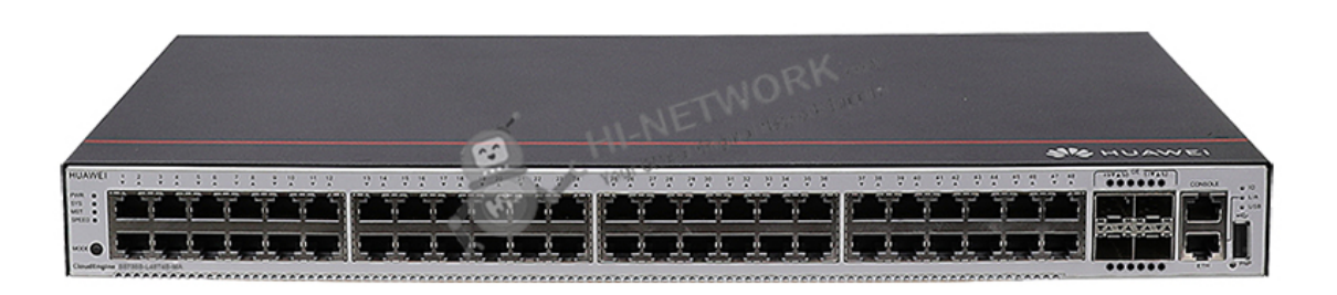
Figure 1 shows the appearance of S5735S-L48T4S-MA.