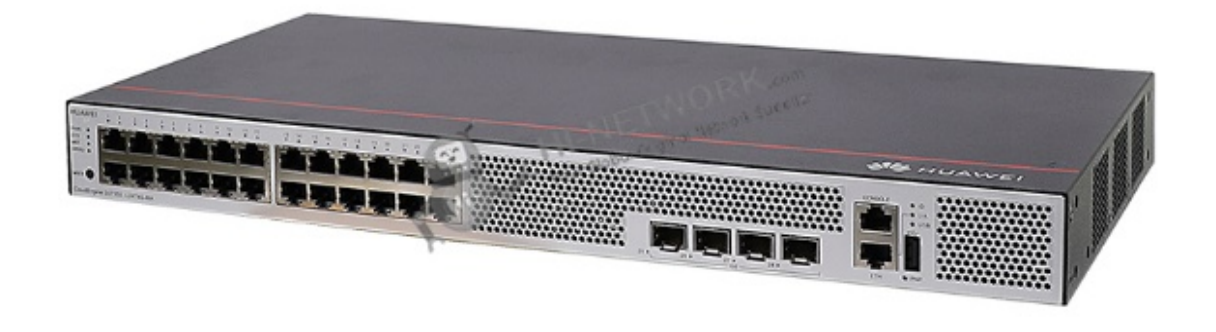
Figure 1 shows the appearance of S5735S-L24T4S-MA.