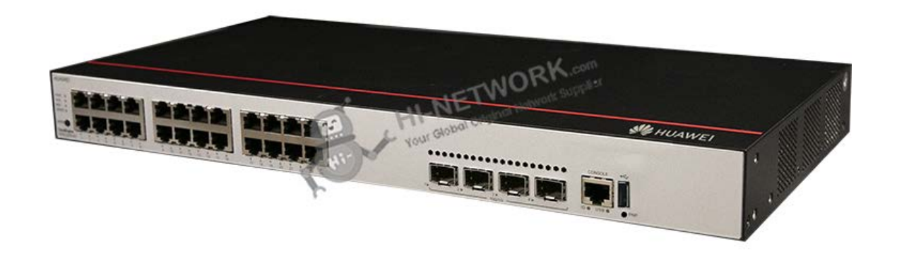
Figure 1 shows the appearance of S5735-L24T4X-IA1.