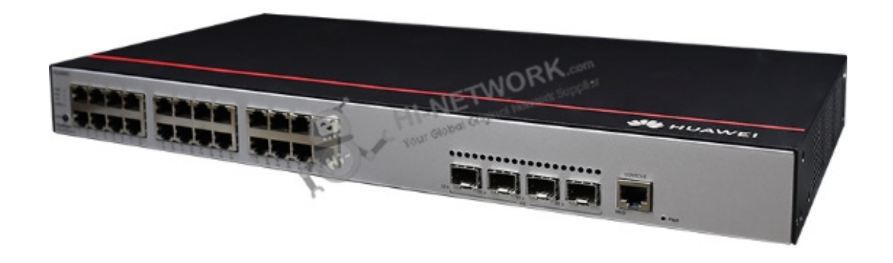
Figure 1 shows the appearance of S5735-L24T4S-A1.