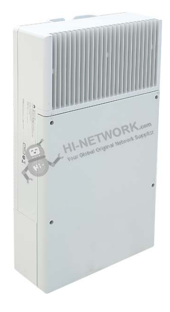
Figure 1 shows the appearance of S5735-S4T2X-IA150G1.