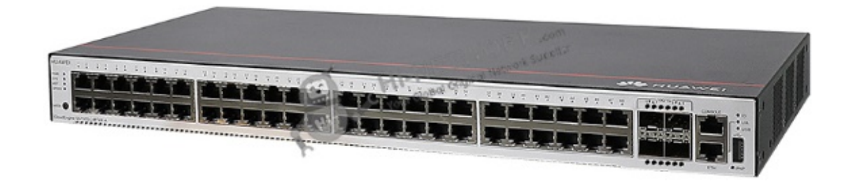
Figure 1 shows the appearance of S5735S-L48T4X-A.