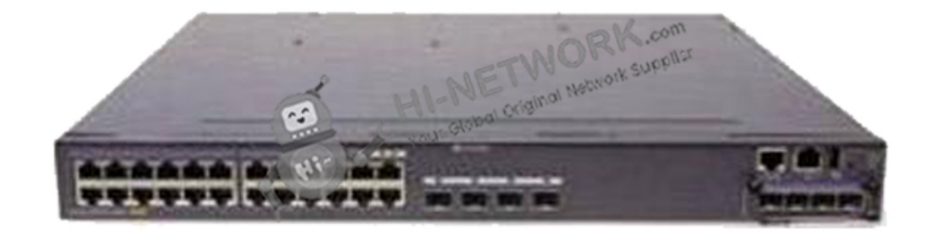
Figure 1 shows the appearance of LS-S5328C-SI.