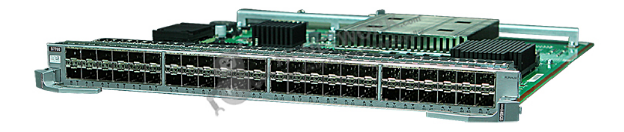
Figure 1 shows the appearance of ES1D2X48SX2S.