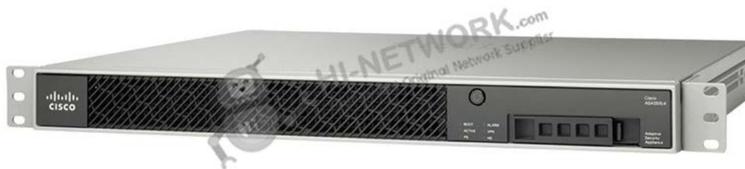
Figure 1 shows the appearance of ASA5515- K9.