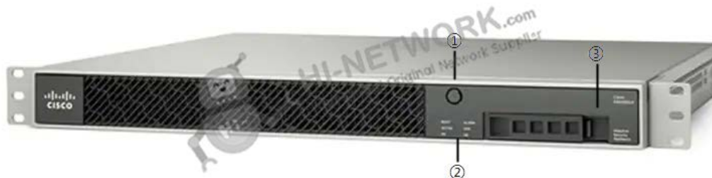
Figure 2 shows the front panel of ASA5515- K9.