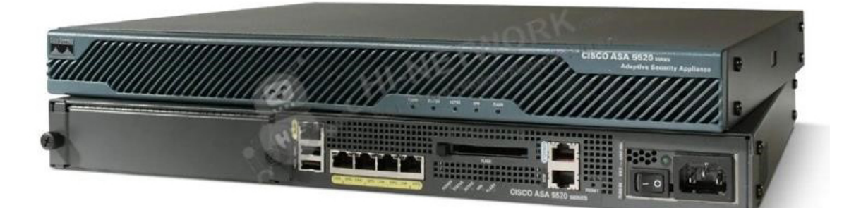
Figure 1 shows the appearance of ASA5520-BUN-K9.