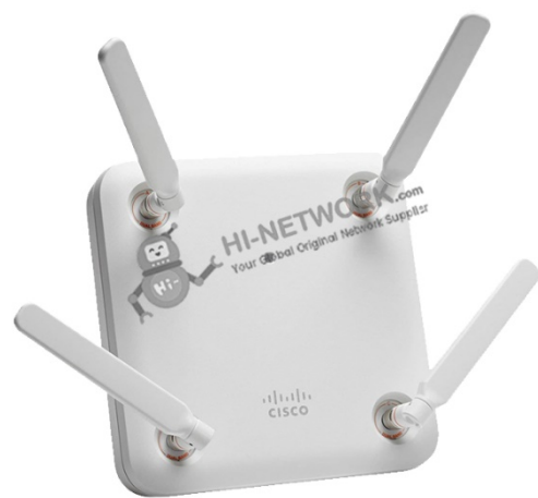
Figure 1 shows the AIR-AP1852E LED Indicator Position.

Figure 1 shows the appearance of the AIR-AP1852E-H-K9C.