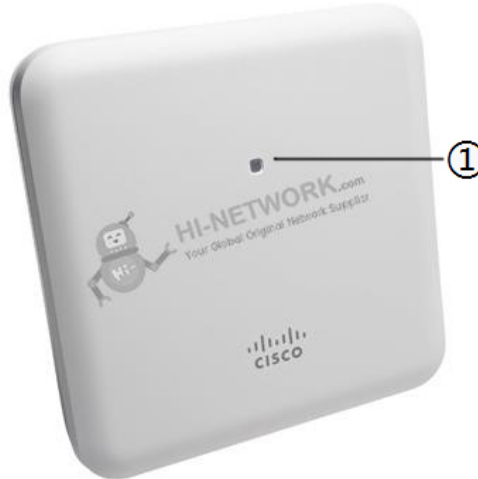
Figure 2 shows the AIR-AP1852I LED Indicator Position.