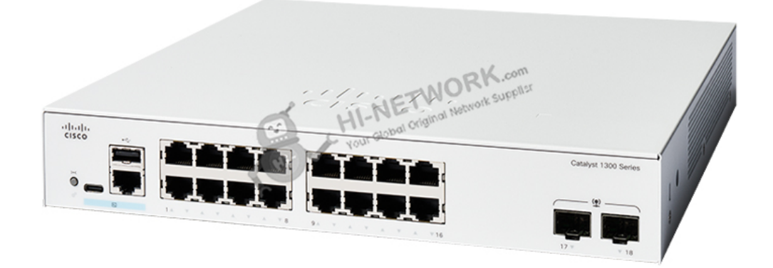
Figure 1 shows the appearance of C1300-16T-2G.