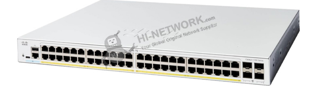
Figure 1 shows the appearance of C1300-48P-4G.