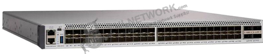
Figure 1 shows the appearance of the C9500-48Y4C-E.