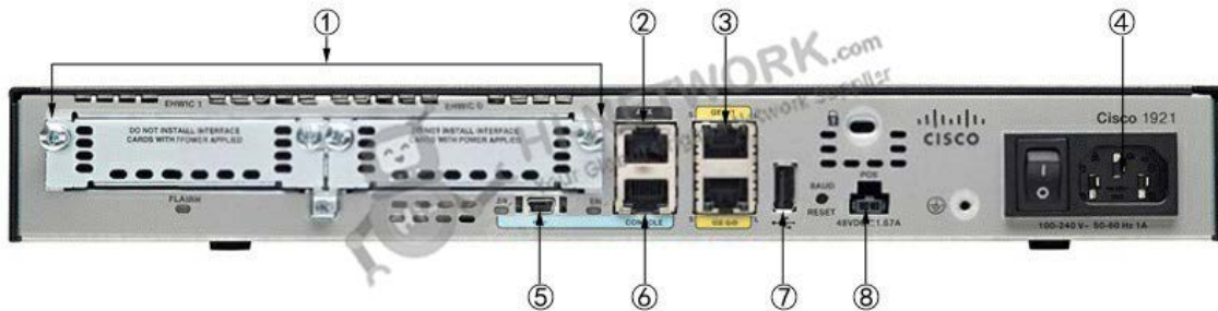
Figure 4 shows the ports and slots on the back panel of Cisco 1921/K9.