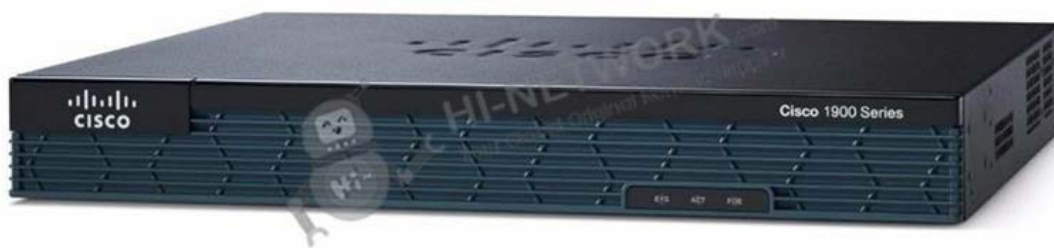
Figure 1 shows the front view of Cisco Router 1921/K9.