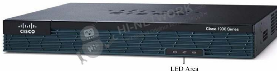
Table 2 shows the front panel LED area description.

Figure 2 shows the status LEDs, on the front panel of the 1921/K9, including three statuses: SYS, ACT and PoE.