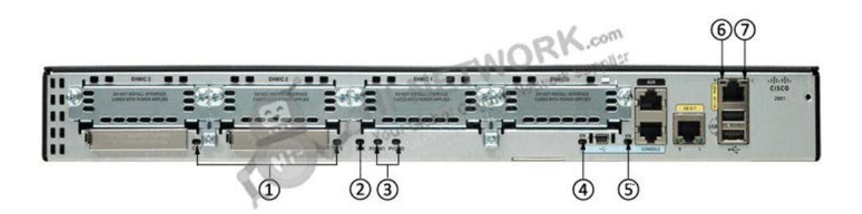
Figure 3 shows the LEDs on the back panel of CISCO2901-SEC/K9.