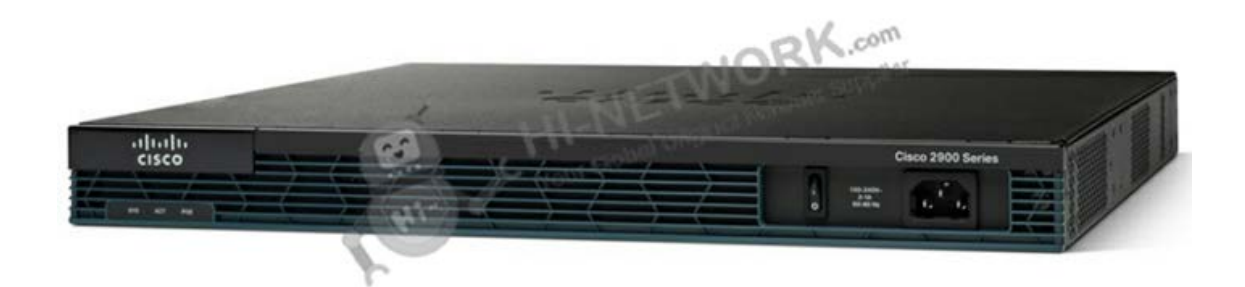
Figure 1 shows the front view of CISCO2901-SEC/K9.