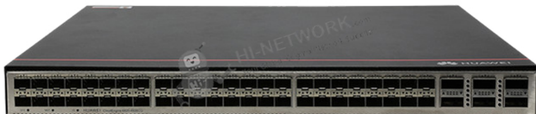
Figure 1 shows the appearance of CE6820-48S6CQ.