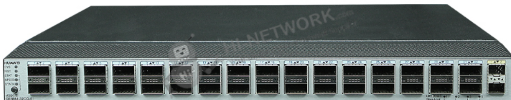
Figure 1 shows the appearance of CE8850-EI-B-B0A.