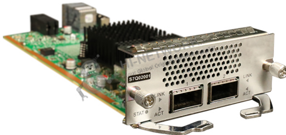
Figure 1 shows the appearance of S7Q02001.